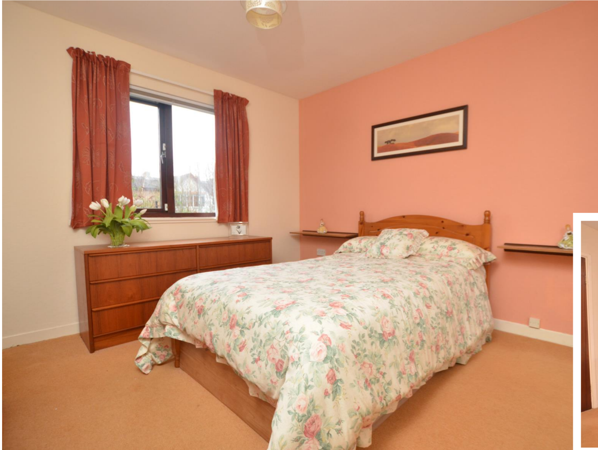
Below: Bedroom 2